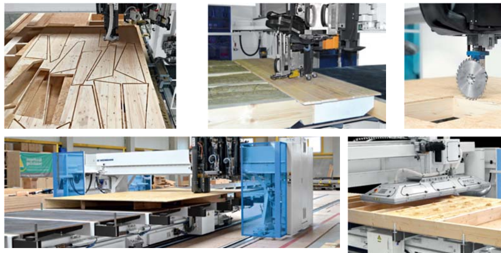
Production of building elements